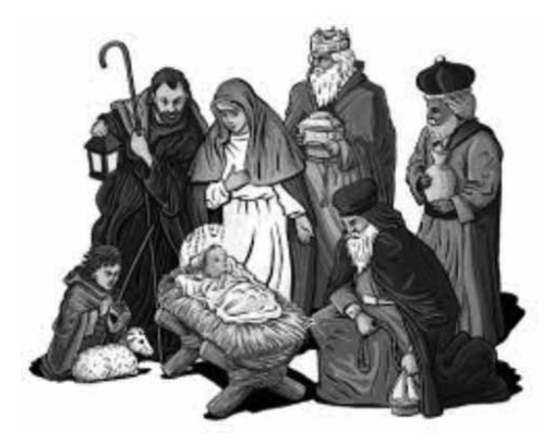
May Jesus Christ bring love and peace to you at Christmas and bless you the year through.